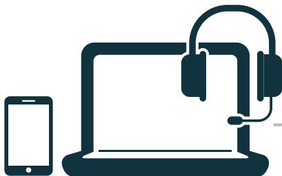
Browser-based UI accesses device microphone and speaker

The Telos Infinity VIP on AMPP makes live media production in the cloud simple, with known user interfaces, expected performance parameters and consolidated business points of contact for the entire solution.